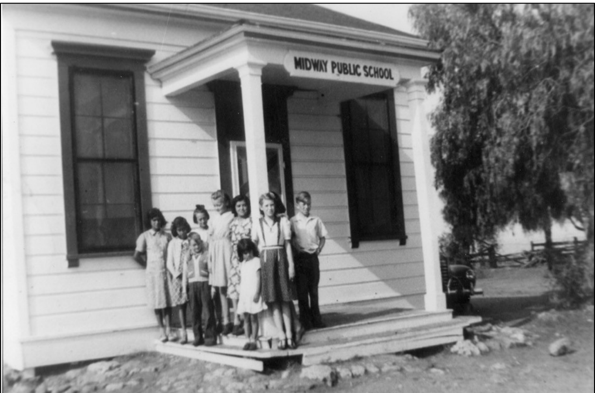
Figure 2: Midway Public School (Year: 1941)

The proposed request includes relocation and restoration of the Midway School that is stored at a private ranch in East County. It is not listed in the Alameda County Register but the address where the structure is located is referenced in the 2005 Comprehensive Survey. The schoolhouse structure is not called out in the 2005 Survey. The proposed request aims to preserve and restore the schoolhouse structure and once it is restored will be served as a community resource. Staff supports the Applicant's request and subject to conditions in alternative to the house remaining on the private property that may result in further deterioration.