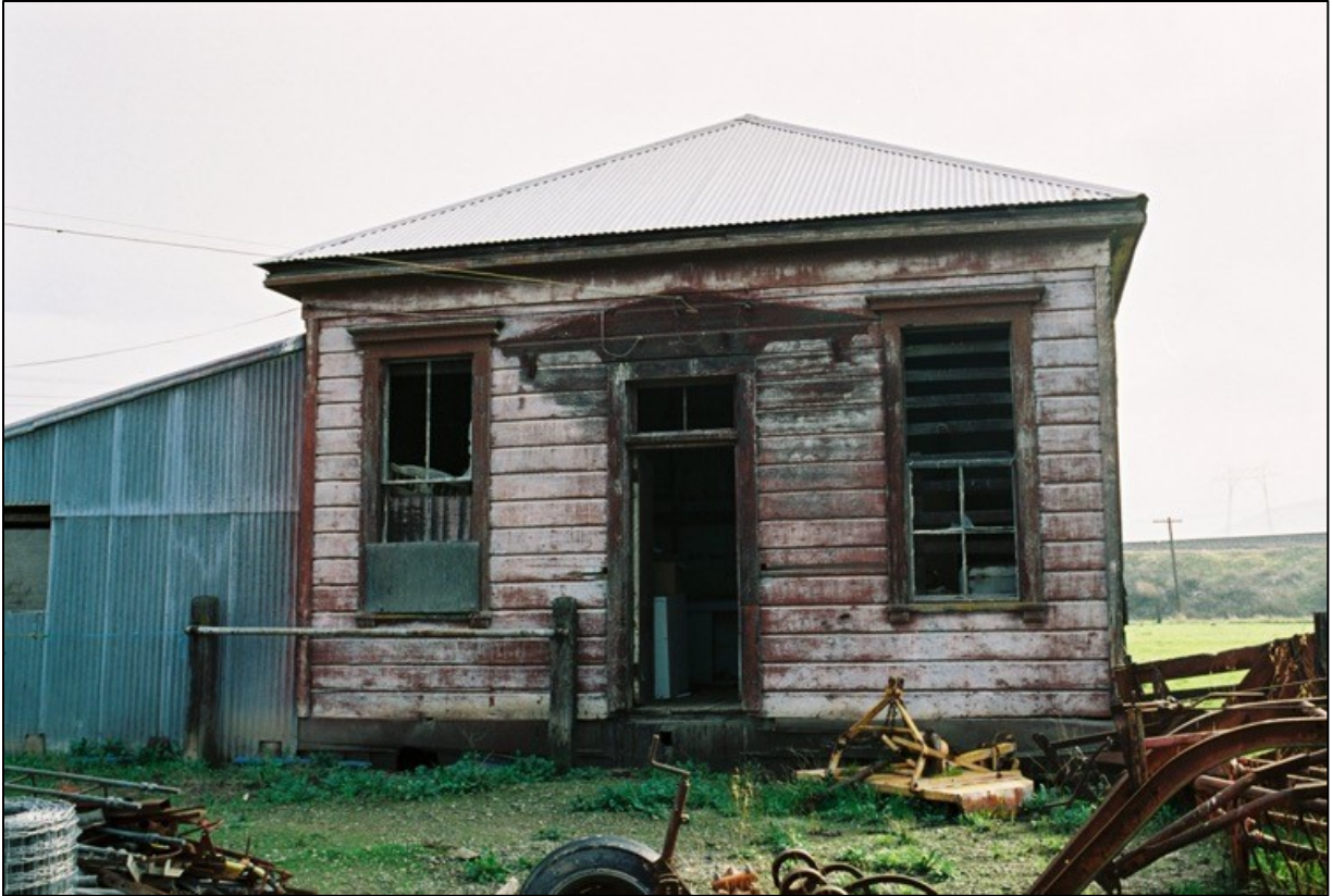
Figure 3: Midway School