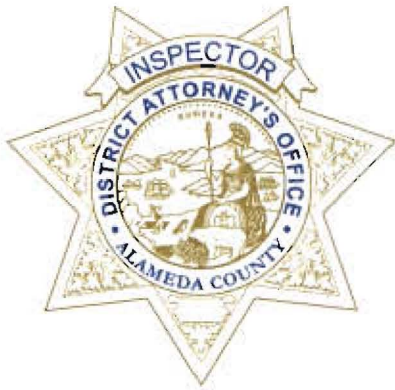
Inspector's Division District Attorney's Office Badge