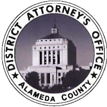
(Alternate) Logo District Attorney's Office