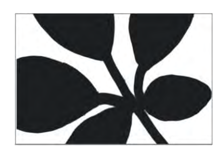
Details of design.