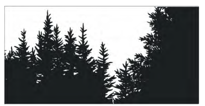
Design for concrete plaza.