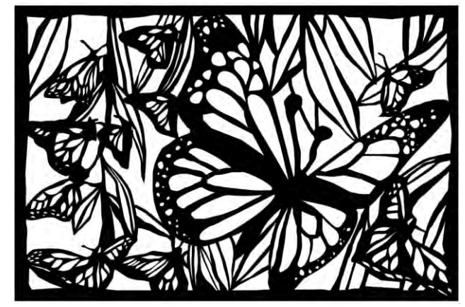
2 designs for Cut Metal Art Panels placed on Street Medians.