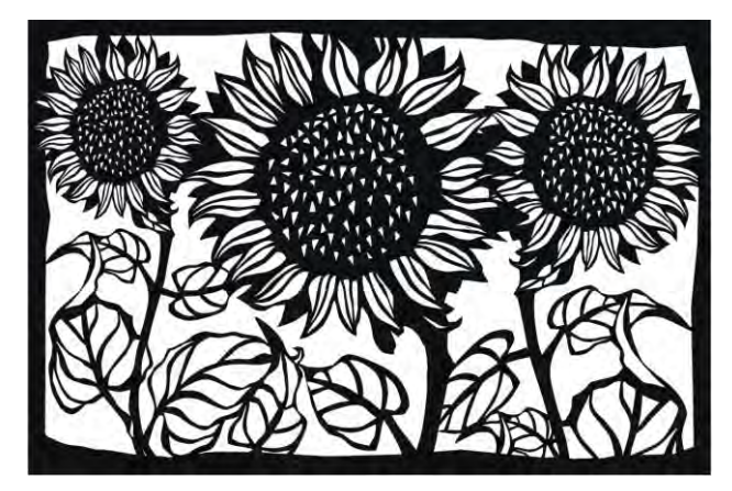
2 designs for Cut Metal Art Panels placed on Street Medians.

Illustration of outdoor seat to be placed on sidewalks.