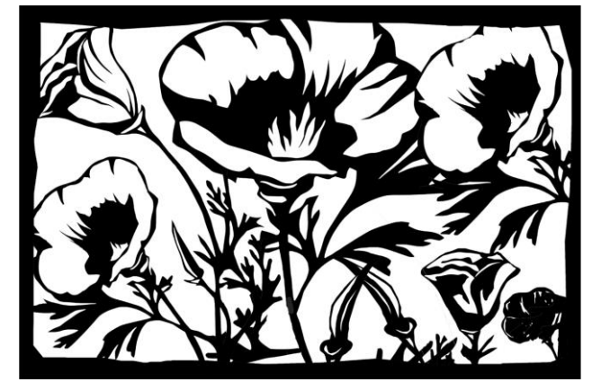
Theme 2: Plants as food and medicine

The artwork invokes beauty, resilience and a sustainable future for communities. The themes for the artwork explore living in harmony with all the living things in the neighborhood and how we are interdependent.