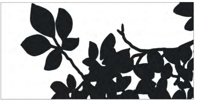
Design for concrete plaza.