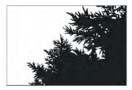
Details of design.