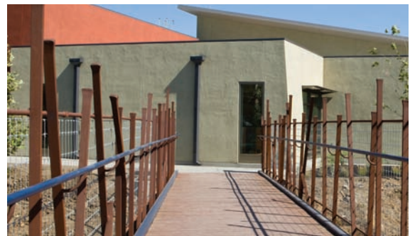
Castro Valley Branch, Alameda County Library