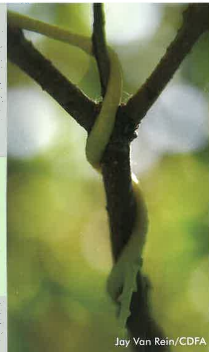
Jay Van Rein/CDFA

CALIFORNIA DEPARTMENT OF FOOD & AGRICULTURE