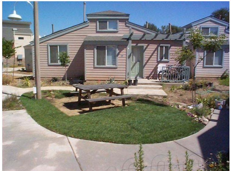
Quinn Cottages, Transitional Housing in Sacramento, CA

If the local government can demonstrate that the multi-jurisdictional agreement can accommodate the jurisdiction's need for emergency shelter, the jurisdiction is authorized to comply with the zoning requirements for emergency shelters by identifying a zone(s) where new emergency shelters are allowed with a conditional use permit.