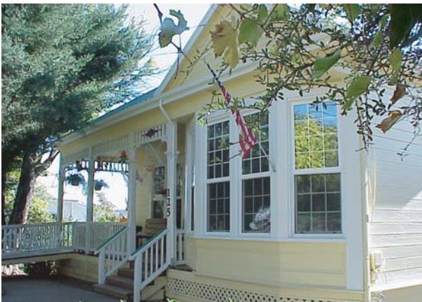
Emergency Shelter – Jackson, California

Requiring a variance, minor use permit, special use permit or any other discretionary process does not constitute a non-discretionary process. However, local governments may apply non-discretionary design review standards.