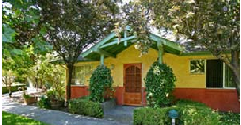
Hendley Circle Apartments – Supportive SRO Housing in Burbank

Many local governments have a record of effective actions to address the homeless needs in their community. SB 2 recognizes and provides flexibility for jurisdictions that have already adopted an ordinance(s) that complies with the new zoning requirements. For those local governments with existing ordinances and zoning consistent with