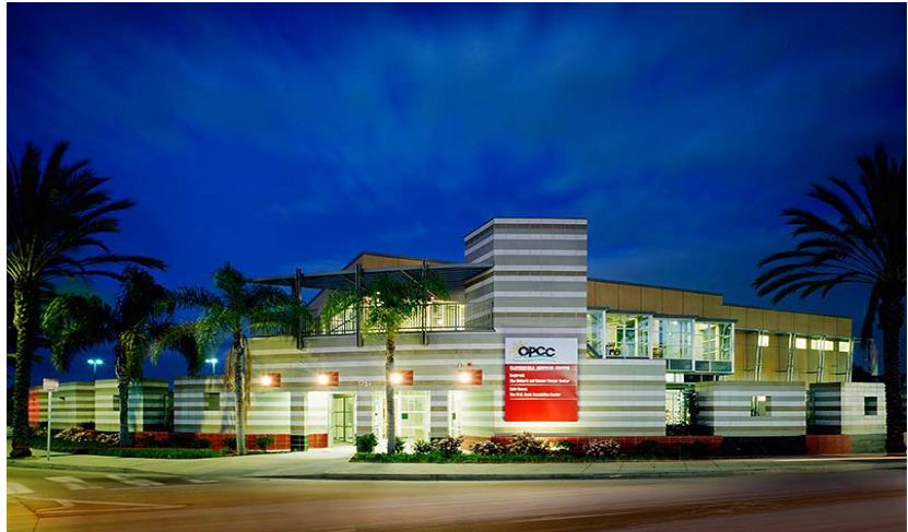
Cloverfield Services Center – Emergency Shelter by OPCC in Santa Monica, CA

Prior to enactment of SB 2, housing element law required local governments to identify zoning to encourage and facilitate the development of emergency shelters. SB 2 strengthened these requirements. Most prominently, housing element law now requires the identification of a zone(s) where emergency shelters are permitted without a conditional use permit or other discretionary action. To address this requirement, a local government may amend an existing zoning district, establish a new zoning district or establish an overlay zone for existing zoning districts. For example, some communities may amend one or more existing commercial zoning districts to allow emergency shelters without discretionary approval. The zone(s) must provide sufficient opportunities for new emergency shelters in the planning period to meet the need identified in the analysis and must in any case accommodate at least one year-round emergency shelter (see more detailed discussion below).