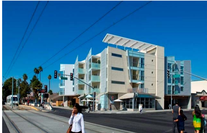
Gish Apartments – Supportive Housing, San Jose, CA

Where a jurisdiction does not provide an analysis demonstrating compliance with the provisions of SB 2 through existing zoning, the element must have a program(s) to address the results of that analysis. For example, if the element does not identify an existing zone to permit emergency shelters without a conditional use permit or other discretionary action, the element must include a program to establish the appropriate zoning, unless the jurisdiction has satisfied its needs through existing emergency shelters or a multi-jurisdictional