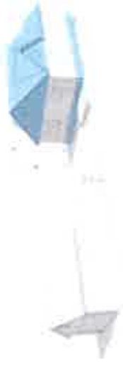
Interior Space Conversion