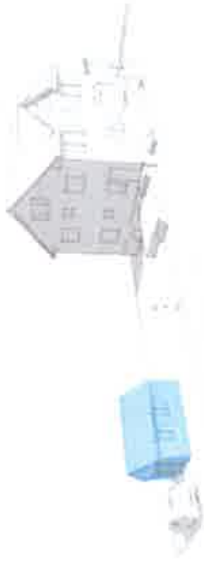
Garage or Accessory Structure Conversion, or New Detached ADU