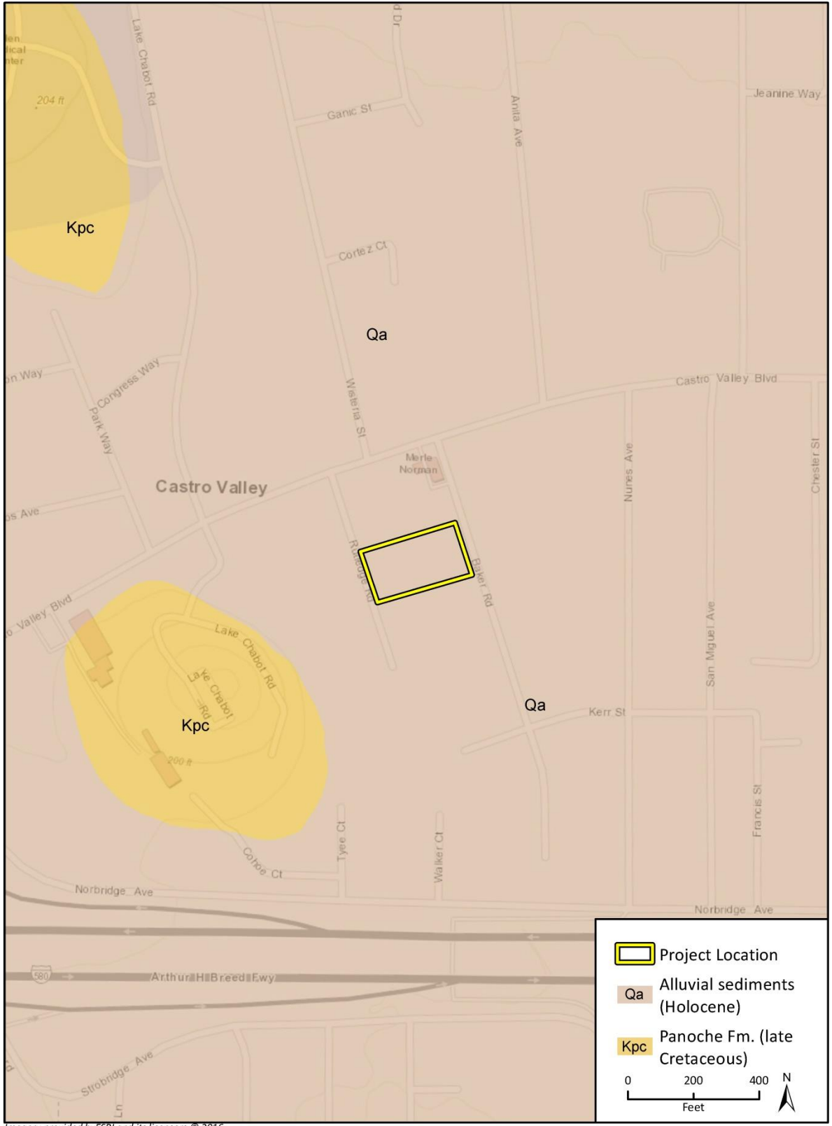
Figure 1 Geologic Map

Imagery provided byESRI and its licensors © 2016. Additional data provided by Dibblee and Minch, 2005, Hayward 7.5' quadrangle