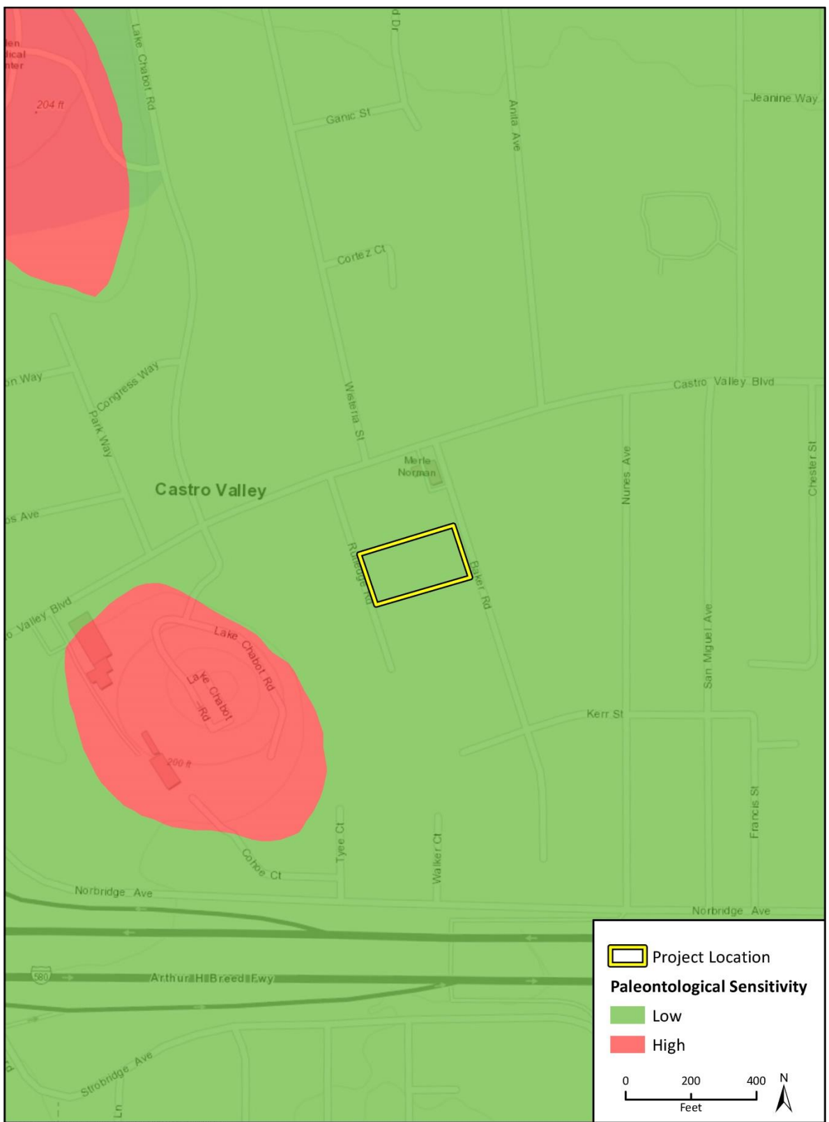
Figure 2 Paleontological Sensitivity Map

Catalyst Development Partners Paleontological Resources Assessment Castro Valley Baker Road Townhomes Project Page 9 of 10