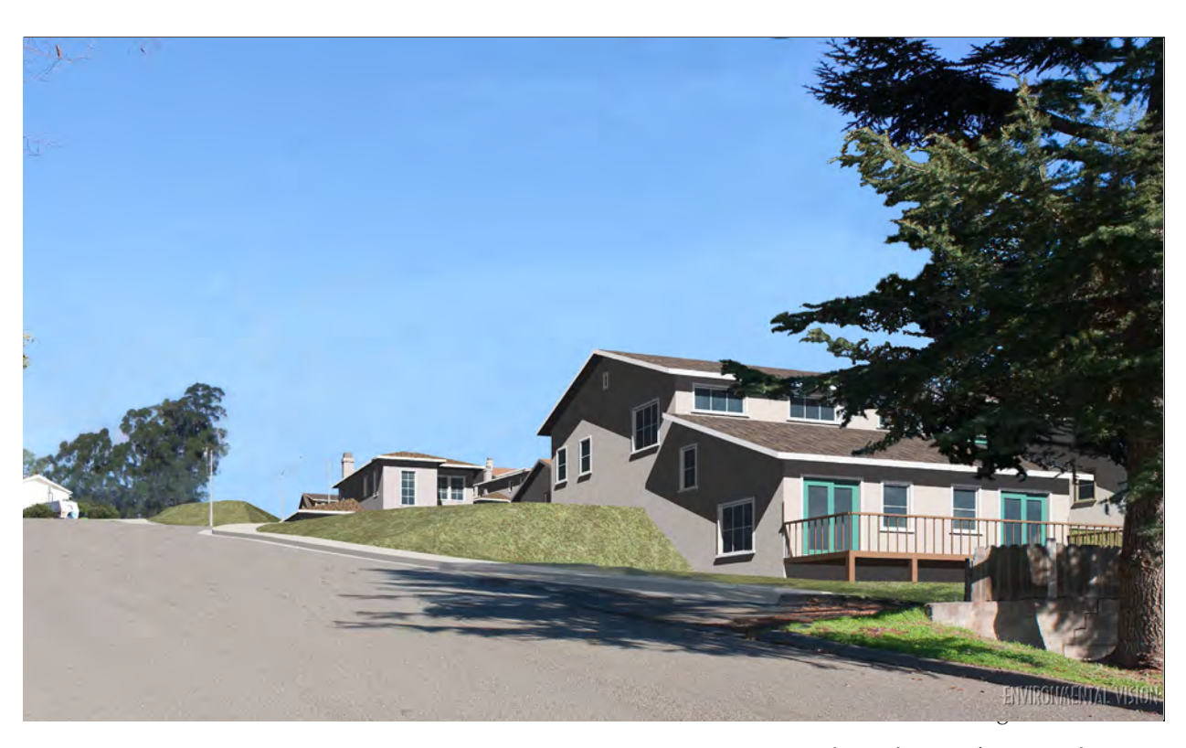
Visual simulation of proposed Project