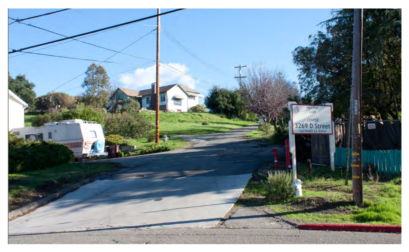
Existing view from D Street near Carlson Court looking southeast