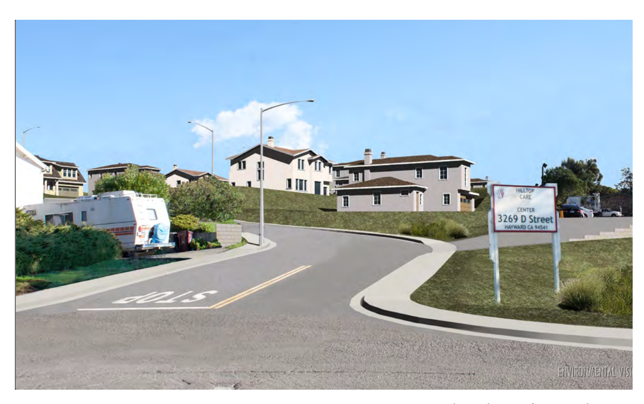
Visual simulation of proposed Project