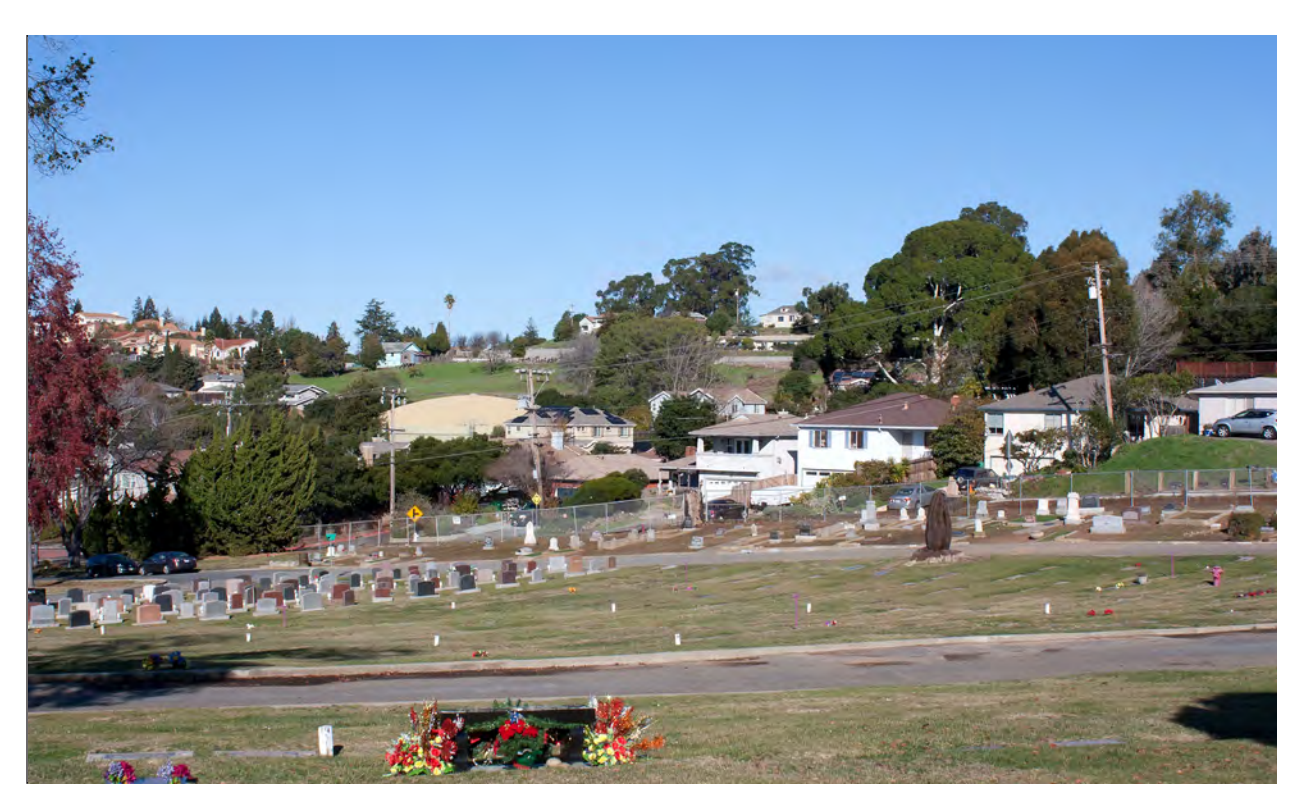
Existing view from Lone Tree Cemetery looking northeast