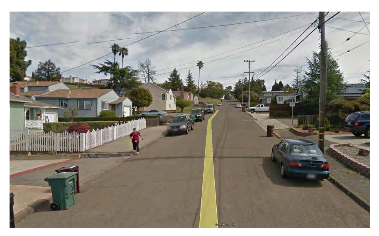
D Street Neighborhood, near Fairview