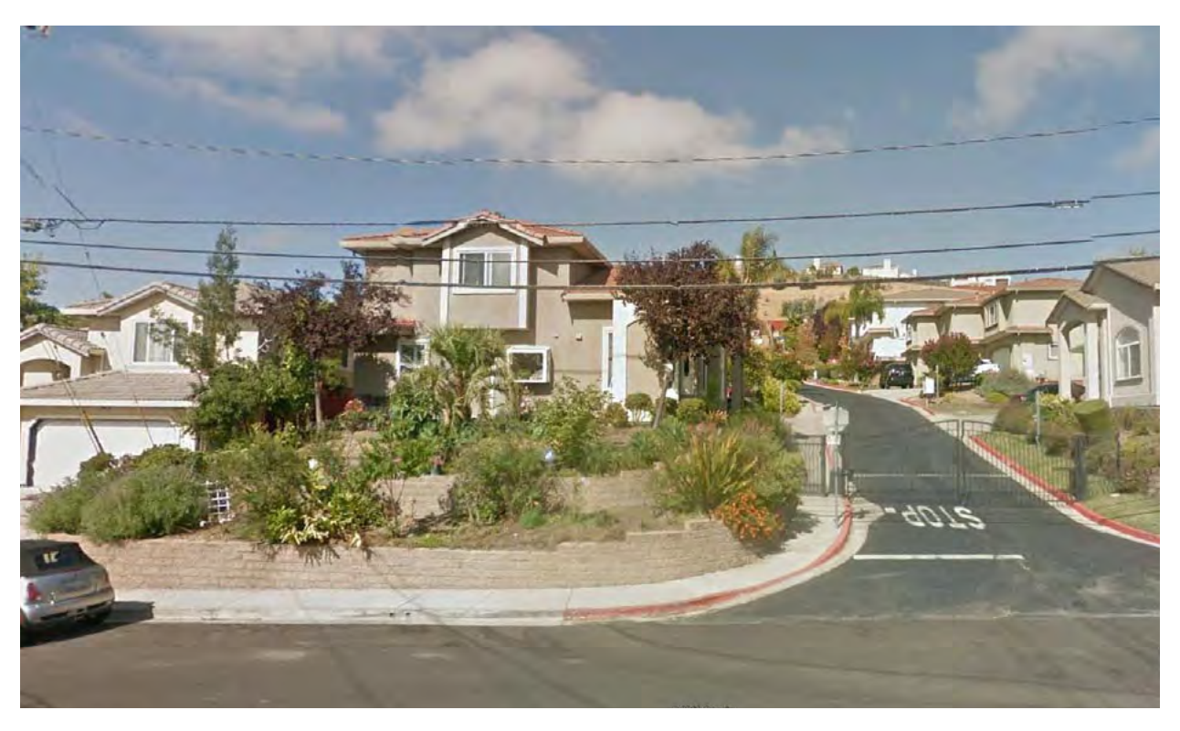
Atwal Court Neighborhood, at Maud