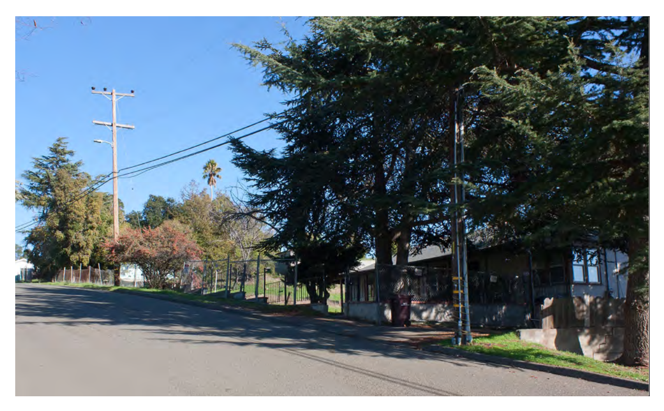
Existing view from D Street near northwest corner of Project site