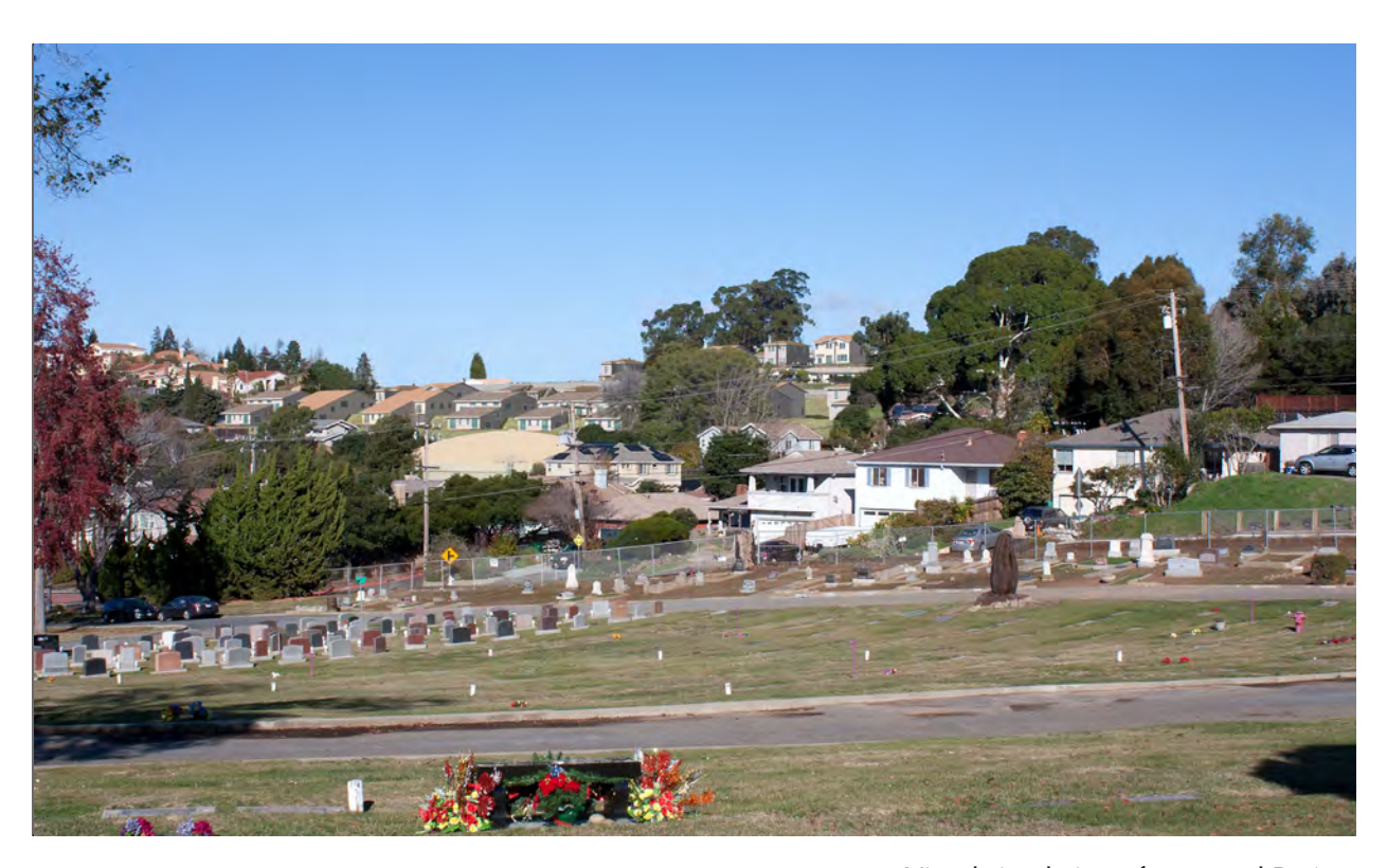
Visual simulation of proposed Project