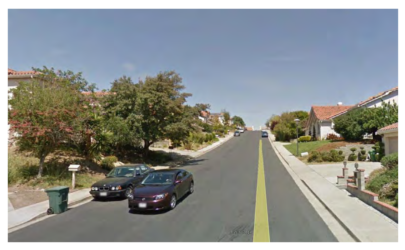
Carlson Court Neighborhood