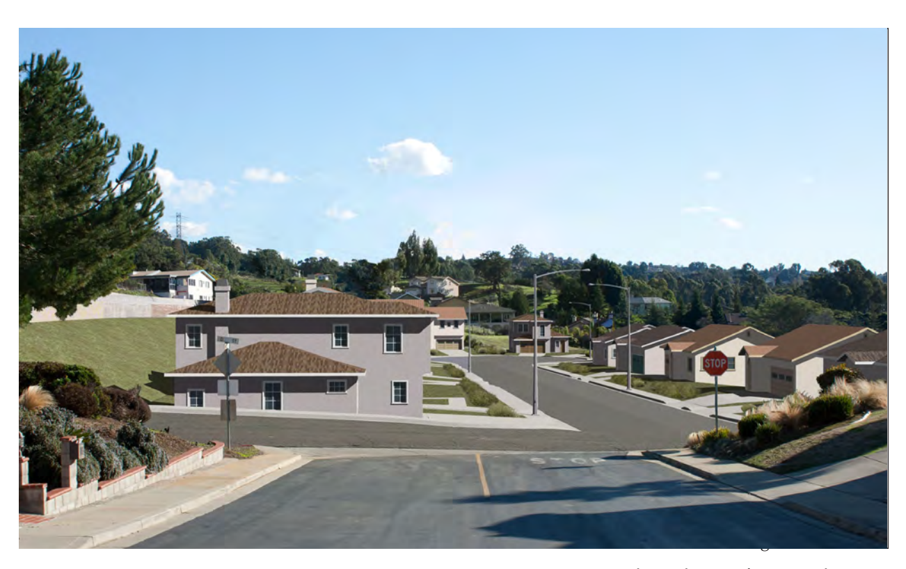
Visual simulation of proposed Project