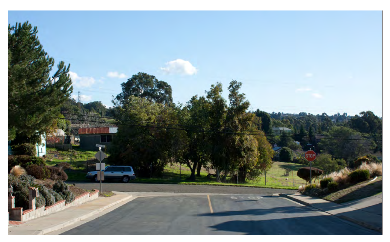
Existing view from Carlson Court looking southeast