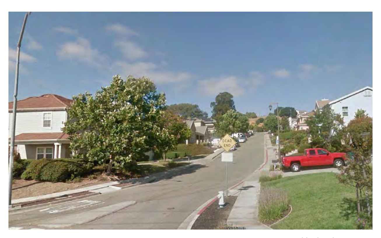
Vista Court Neighborhood at Fairview