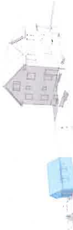
Garage or Accessory Structure Conversion, or New Detached ADU