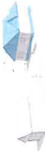
Interior Space Conversion