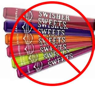
Flavored Cigars, Cigarillos, Little Cigars, Cigar/Blunt Wraps