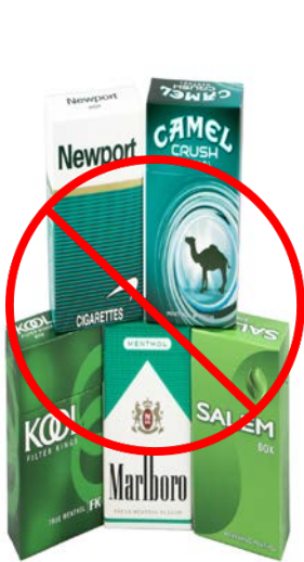
Menthol, Mint, or Wintergreen Flavored Cigarettes

This includes, but is not limited to, the following flavored tobacco products: