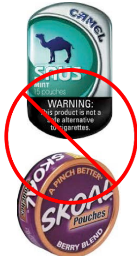
Flavored Chewing Tobacco and Snus