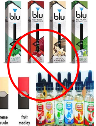
Flavored E-cigarettes, E- hookahs, Vape Pens, JUUL, and E-Liquids