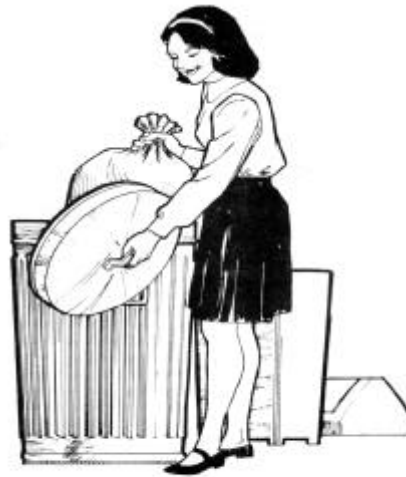
Fig.2 Place sealed garbage bags in garbage can with close fitting lid.