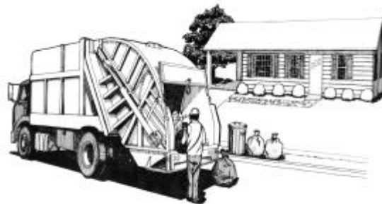
Fig. 3 Authorized garbage collection service.