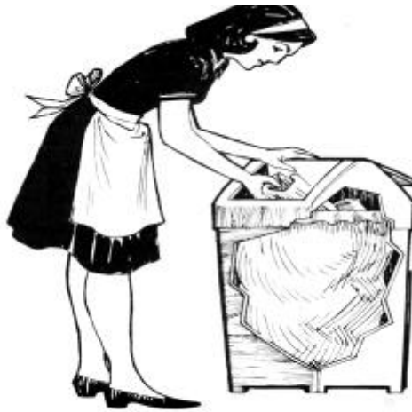
Fig. 1 Place garbage in sealable plastic bags.