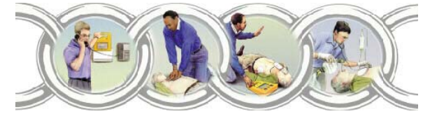
The Chain of Survival

Lists of known organizations that provide AED Program consultation and/or training in the use of AEDs, and AED vendors can be found at our Web site.