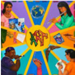
REACH Ashland Youth Center opened to the public in April 2013 in a new state-of-the-art facility with engaging programs and services provided to Alameda County youth, ages 11-24, in the areas of recreation, education, arts & creativity, career development, and health & wellness.