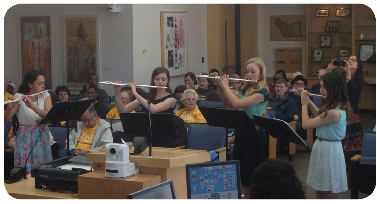
Members of the Flute Quartet at Wells Middle School in Dublin performed for the Alameda County Board of Supervisors on March 3rd to celebrate the Board's declaration of March as Art IS Education Month. Sponsored by the Alameda County Arts Commission and several community partners, Art IS Education promotes the premise that arts learning is fundamental to quality public education.