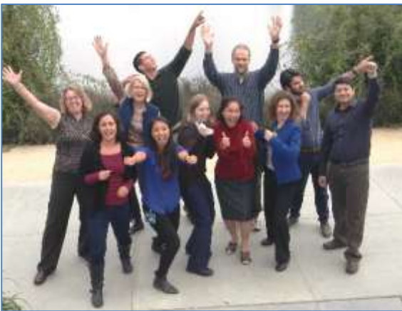
Some of the fun people you would work with