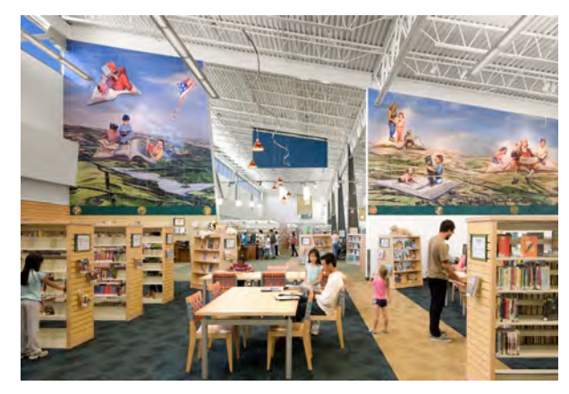
Artwork in the County's Castro Valley Library by Jos Sances, part of the Alameda County Art Collection.

Alameda County owns or leases approximately 8.7 million square feet of facilities and maintains public infrastructure in unincorporated areas. Achieving our climate target will require us to decarbonize energy use by transitioning away from natural gas to electric-powered equipment in our buildings. This will eliminate burning fossil fuels on-site