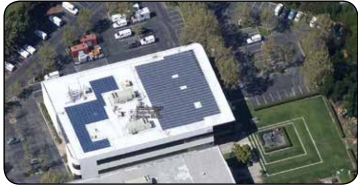
Alameda County Environmental Health Department contributes to good environmental health by using less resources.

Approximately 105 people work at the facility. The amount of daily water use for an office building can vary, but studies show an average of 8-12 gallons of water per day (gpd) per employee. This includes moderate hand washing, flushing, and office cleaning. Average daily water use for ACEH would normally come to about 1,050 gallons per day. After implementing water savings measures, ACEH offices showed an average indoor water use of just 537 gallons per day in 2012—a laudable achievement.