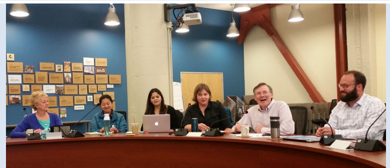
City and public agency representatives gather at the Roundtables to learn and share green purchasing strategies.