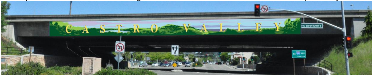
Castro Valley Community Identifier Mock-Up. Artist: Robert Minervini

Castro Valley: Caltrans approved the Castro Valley project with the requirement that 20 feet of concrete remain unpainted on each side to enable to routine inspection of the structure. The unpainted areas are primarily above the sloped embankments and retaining walls. The Illustration below includes the required adjustments.