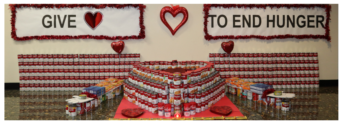
The Assessor's Office's 2019 Stone Soup Food Drive display won Alameda County's Most Inspiring Award Click on image for a short video!

When the Stone Soup Food Drive Campaign ended in March, food donations continued to arrive, this time from the public. In April, a panel of judges presented the Assessor's Office with the Most Inspiring Award at the Board of Supervisors' Awards Ceremony.