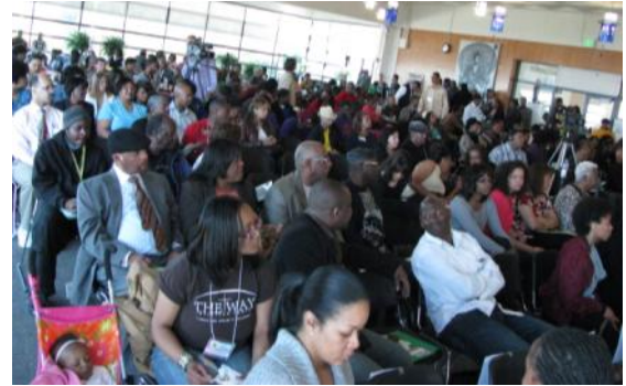
In May 2010, more than 300 people representing dozens of organizations met at Merritt College in Oakland to check in about the state of the African American community in the Bay Area.

Following the success of African American Organizations Making Connections in May 2010, a group of community members have come together to plan a follow-up event in February, 2013.