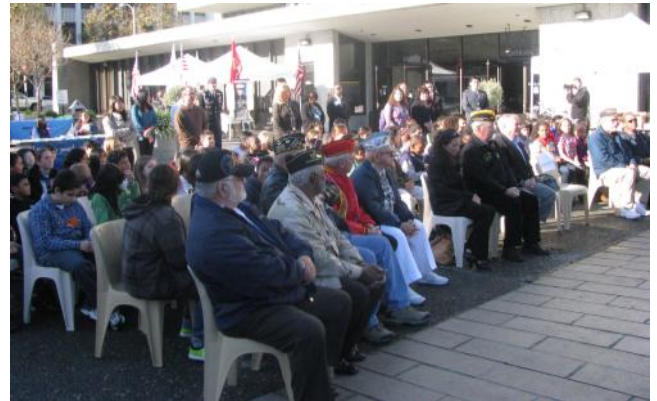
Veterans and community members celebrate Veterans Day in front of the Alameda County Administration Building on Tuesday, November 13, 2012.

In 2011, the President signed the VOW to Hire Heroes Act , which includes the Veterans Retraining Assistance Program (VRAP) . VRAP offers up to 12 months of training assistance to unemployed Veterans.