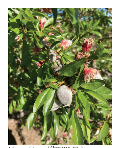
Almond tree (Prunus sp.)