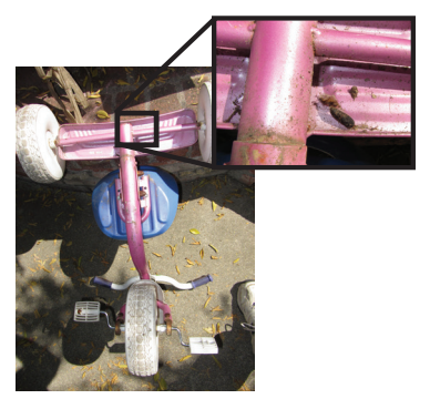
Tricycle with Spongy Moth pupa