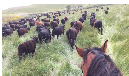
Beef Cattle.