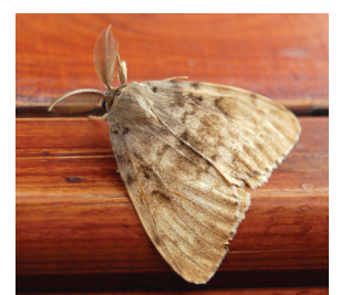
Spongy Moth

Working in collaboration with CDFA's boarder stations, the county is alerted to incoming shipments of household goods for people moving from infested areas of the country. Upon arrival at its destination inspectors go out and inspect all household items that were previously stored outside. Inspectors search every surface of these items looking for adults, larvae, and egg masses of the Spongy Moth (Lymantria dispar) and Spotted Lanternfly (Lycorma delicatula) . Egg masses of both species look like a smear of dried mud, and can be difficult to spot. When found the masses are removed from the surface, and sent to the CDFA's Plant Pest Diagnostic Center to confirm identification.