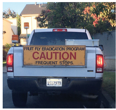
CDFA conducting fruit fly treatment