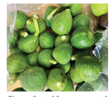
Figs confiscated from nursery stock

On September 20, 2021, Agriculture and Standards Investigator Alejandro Regalado-Talavera reconditioned an incoming shipment of fig trees from Ventura County by removing the fruit off the trees in response to a Pest Alert from the California Department of Agriculture (CDFA) for the Black Fig Fly ( Silba adipata ). ASI Regalado -Talavera confiscated 100 figs, which he inspected for pests. Suspect Black Fig Fly larva were found and sent to the CDFA's Plant Pest Diagnostics Center for identification. It was confirmed that the larvae's DNA is consistent with Quarantined-rated Silba adipata (Black Fig Fly). All remaining fruit was destroyed.