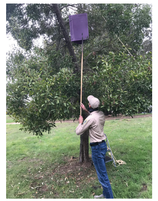
Dorin Ciocotisan placing an EAB trap