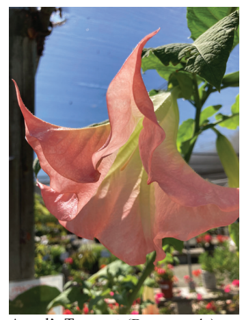
Angel's Trumpet (Brugmansia)