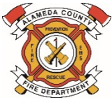
EXHIBIT A PRE-QUALIFICATION RESPONSE PACKET