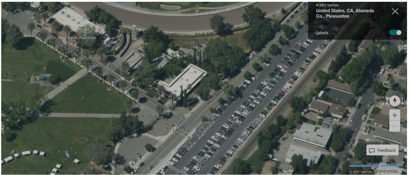
Alameda County Fairgrounds 4501 Pleasanton Ave., Pleasanton