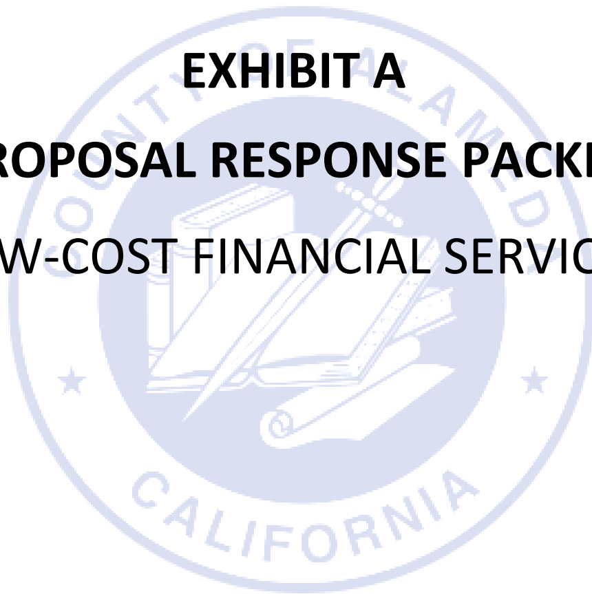
EXHIBIT A PROPOSAL RESPONSE PACKET LOW-COST FINANCIAL SERVICES