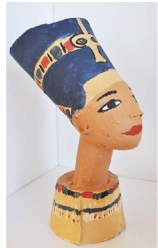
Nefertiti sculpture by student from Wood Middle School.