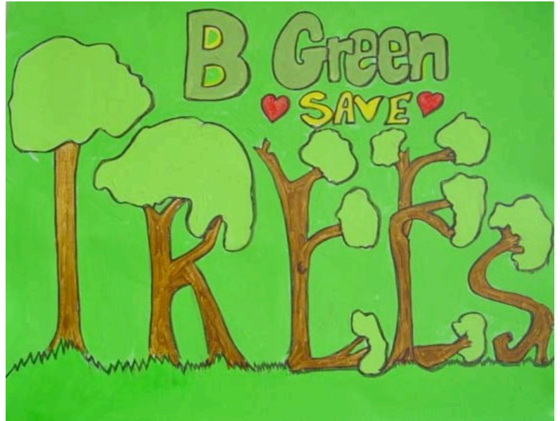
Support Recycling Painting by JJC youth.

This project drew on Energy Quest online resources developed by the California Energy Commission. For more information please visit www.energyquest.ca.gov/saving_energy/RECYCLINGFactsGame.pdf .