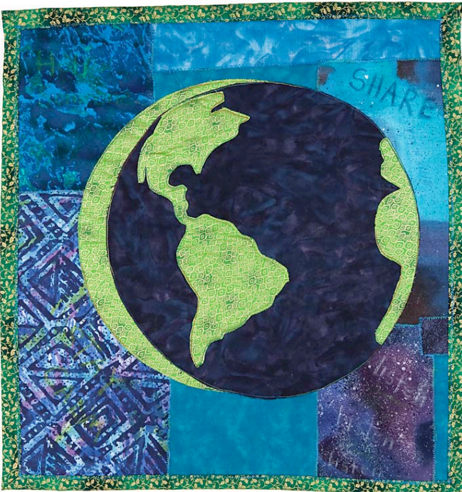
Earth Quilt by JJC youth.