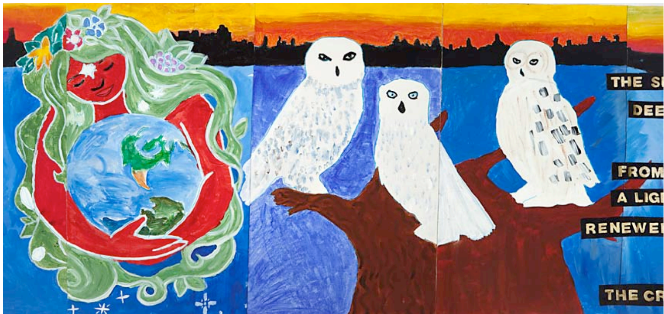
Details of the Creating Solutions Mural: Transformation by JJC youth.

One student reflected, “When I saw the finished project, I felt proud because we did it as a group. I found out I really like working with my hands.” Another student said, “I learned that in art, you can be yourself and not worry about everything being perfect. This project helped me feel less sad and think about things outside of juvenile hall.”