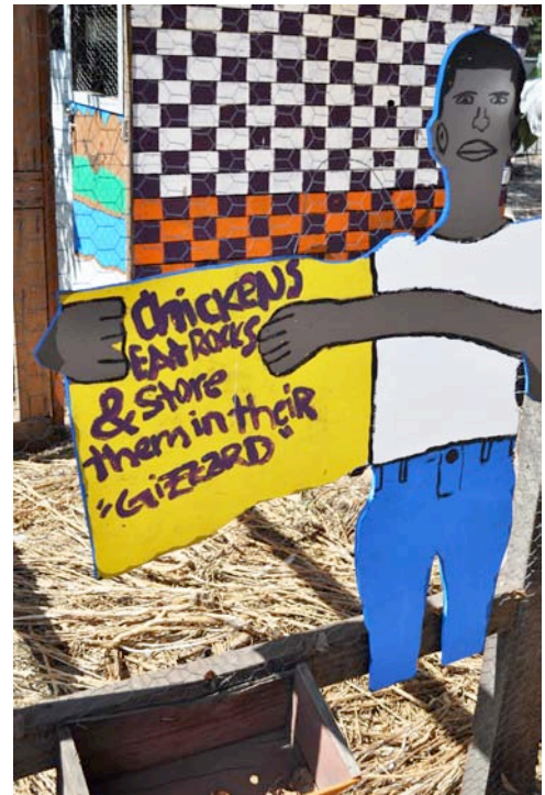
Garden artwork by students from Leadership Public School.

2) Students at Leadership Public School on Castlemont Campus in Oakland used landscape design and public art to create an urban farm to help promote peace and address the challenge of urban food deserts. The garden provides the school community with an outdoor science lab, bountiful harvests and a boost to student enthusiasm for learning and community involvement.