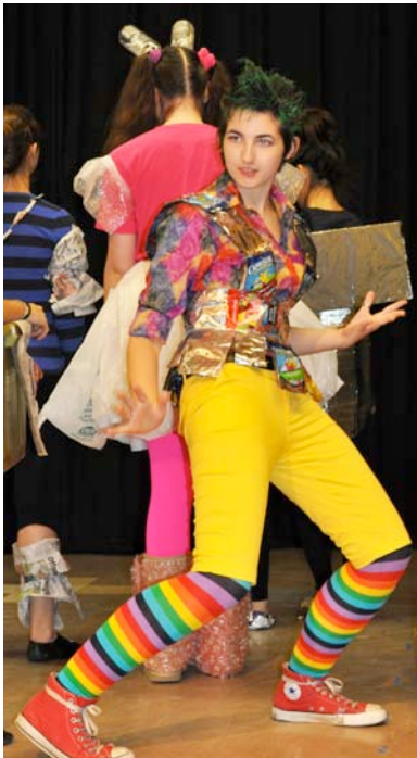
Theatrical performance by Irvington High students.

Through this program, more than a dozen schools across Alameda County have created arts projects that highlight waste reduction themes. A wide range of arts disciplines have been employed including theatre and circus arts, music and songwriting, digital art and animation, and both two-dimensional and three-dimensional visual arts. Using the service-learning model, all projects include ways for the project to be shared with the school or local community or directly impact the needs of the community.